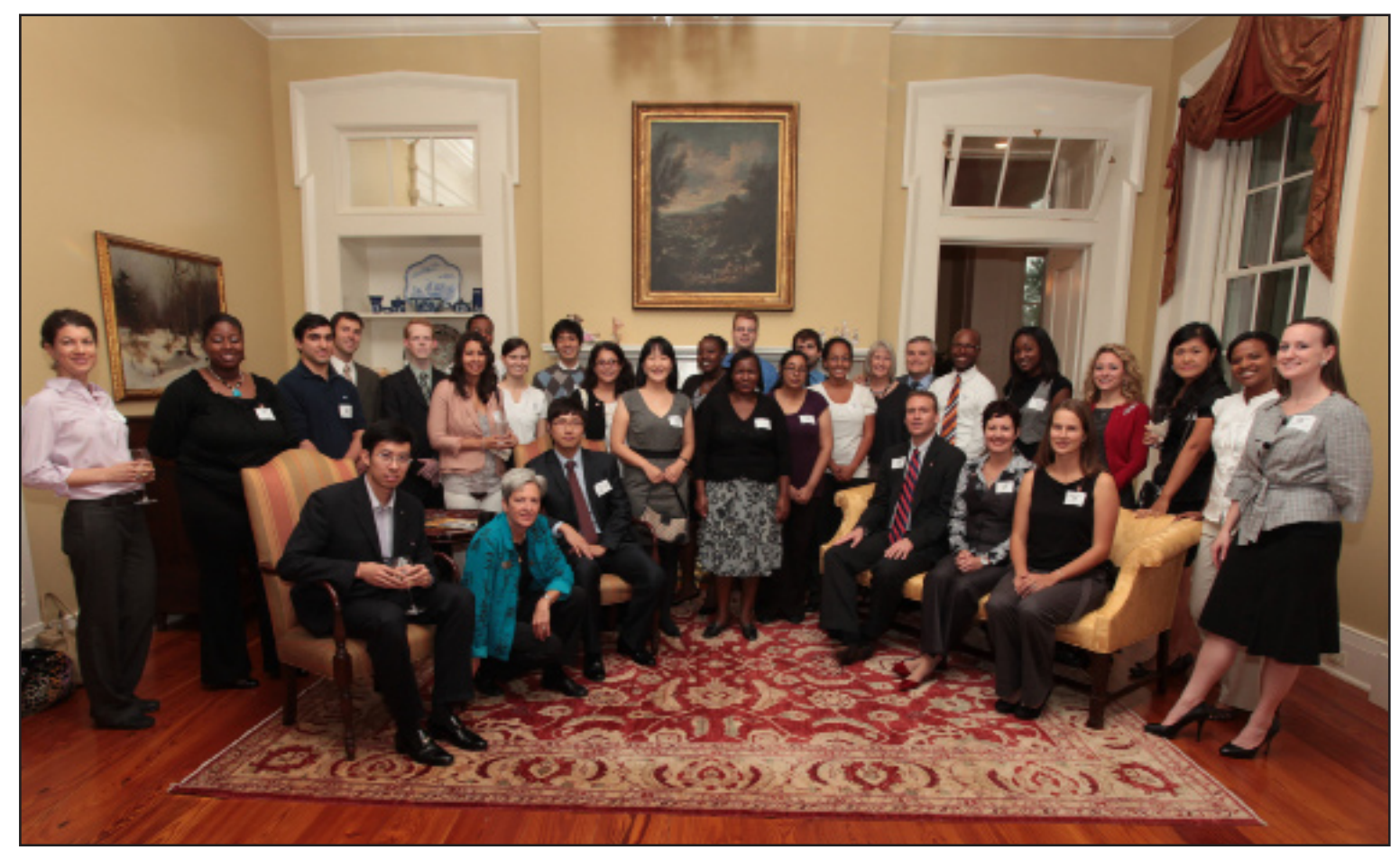
2011-12 Fellows Society President's Social

Members of the Fellows Society are currently planning for the upcoming Fellows Forum, which will take place later in the spring semester. This spring's forum will address the topic of the food system, addressing issues such as food production, distribution, and the social networks involved in the food system. For more about the Fellows Forum and the Fellows Society, please visit http://gradschool.fsu.edu/Fellows-Society