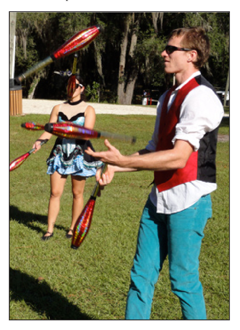
Members of the FSU Flying High Circus performed for excited onlookers.

On October 4, 2011, The Graduate School hosted the Carnival @ the REZ for graduate students and their families at the FSU Reservation. The Carnival was co-sponsored by many FSU supporters—the Congress of Graduate Students (COGS), Black Graduate Student Association (BGSA), Alumni Association, Center for Global Engagement, School of Communication, Circus, Alumni Village, Alumni Village Childcare Center, Athletic Department, Theta Nu Xi Multicultural Sorority, Inc., and Tallahassee's Eclectic Acoustic Band. With perfect autumn weather, FSU fami-