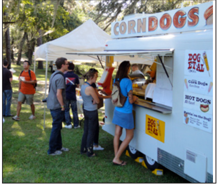
Students enjoyed hotdogs and corndogs catered by Dog et al.

lies remained until the REZ closed at 7:00 P.M.