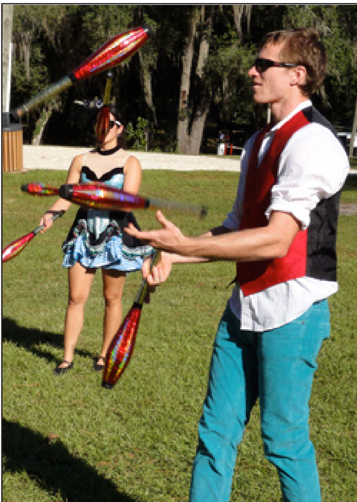
Members of the FSU Flying High Circus performed for excited onlookers.

The 2011 Carnival was a great opportunity for networking with other graduate students who are also balancing family life, parenting,