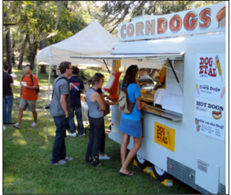
Students enjoyed hotdogs and corndogs catered by Dog et al.

On October 4, 2011, The Graduate School hosted the Carnival @ the REZ for graduate students and their families at the FSU Reservation. The Carnival was co-sponsored by many FSU supporters—the Congress of Graduate Students (COGS), Black Graduate Student Association (BGSU), Alumni Association, Center for Global Engagement, School of Communication, Circus, Alumni Village, Alumni Village Childcare Center, Athletic Department, Theta Nu Xi Multicultural Sorority, Inc., and Tallahassee's Eclectic Acoustic Band. With perfect autumn weather, FSU fami-