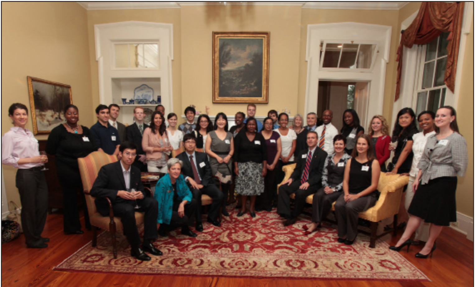
2011-12 Fellows Society President's Social