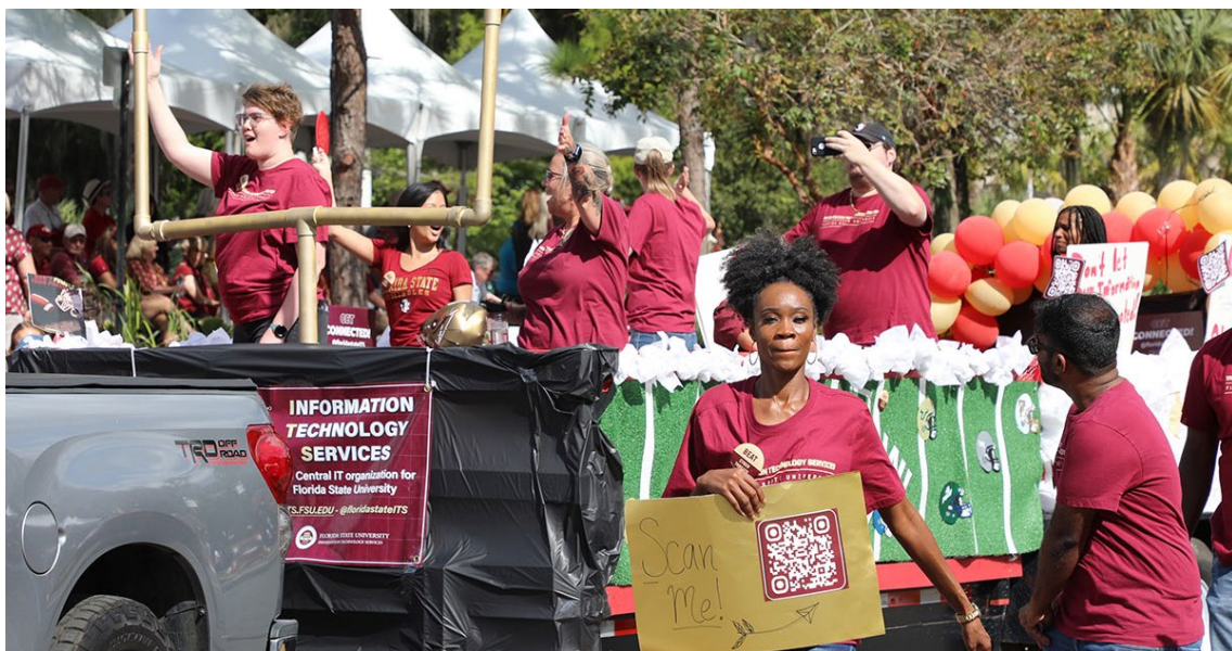
ITS Homecoming Float